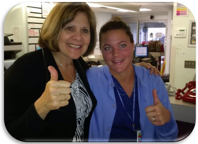
Satisfied E-Req Users from the OR at PSFDH!

A total of 31 Users and 1 Buyer were trained at PSFDH.