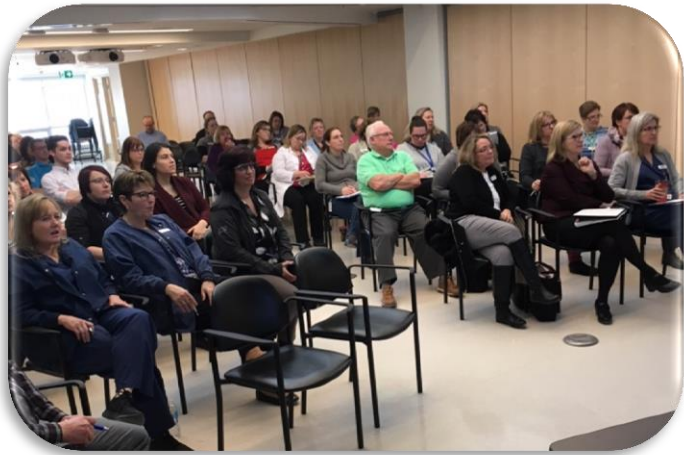
QHC Staff participating in an E-Req demo in preparation for the go-live

Onboarding of the 6 hospitals in the Region is nearly complete, with the most recent E-Req go-live at Quinte Health Care (QHC) in February.