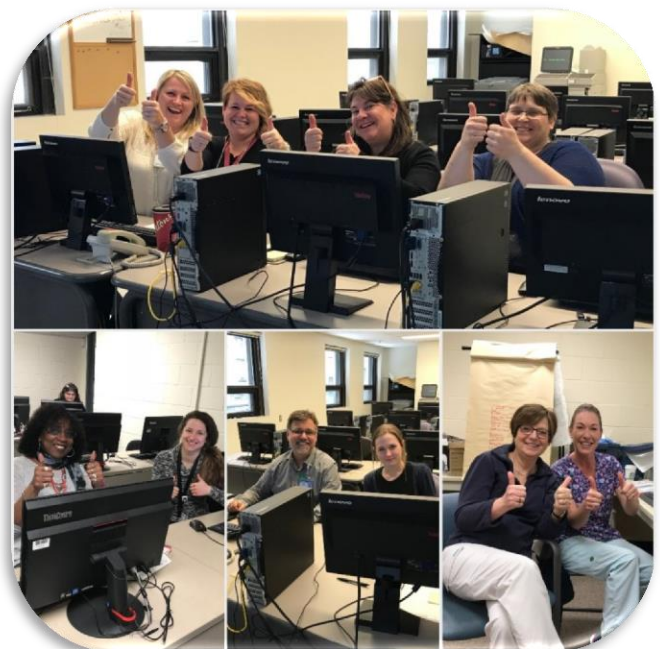
New Users at KHSC receiving in-class training and support from the Project Team during go-live

A total of 180 Users and 4 Buyers were on-boarded at KHSC.