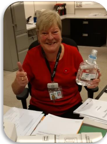
Satisfied E-Req Users!

A total of 38 Users and 2 Buyers were trained at PCH.